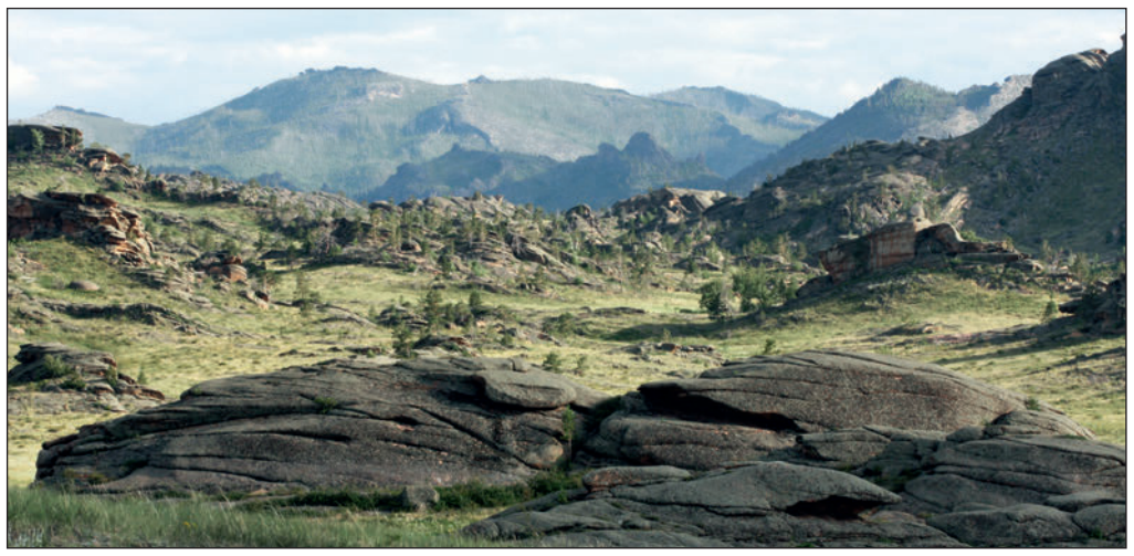
Fig. 1. Bayan-Aul Mts., June 14, 2009.