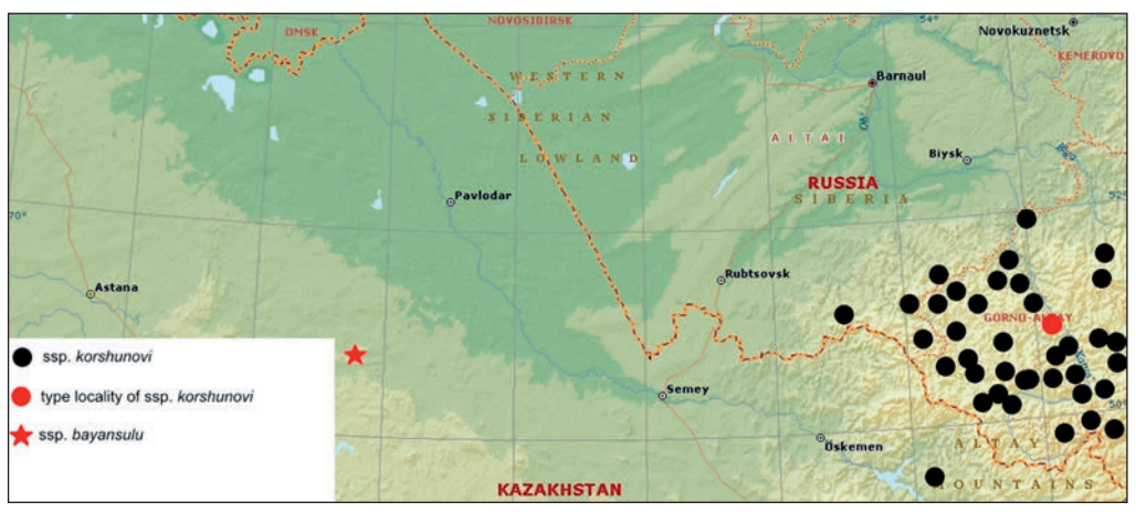
Fig. 2. Distribution of Parnassius nomion Fischer de Waldheim, 1824 (western part of the range).

R4 cell (always red-centred); submarginal row forming an almost uninterrupted grey band; marginal area broad, covered with sparse grey scales, semitransparent, with white dashes between veins. Hindwing with a pair of red, white-centred spots bordered with black; anal margin with broad irregular black area; along anal edge towards tornus with an elongate black spot that is usually separated with a pale interspace at vein Cu2; submarginal row consisting of semicircle with somewhat defined spots; marginal zone with grey semitransparent spots at veins and broad white areas between them; fringe black at veins, with small white interspaces between them. Hindwing underside pattern almost identical to upperside, except for small red black-edged spots basally and two red black-edged spots corresponding to the elongate one on upperside anal area; spot in cell Cu2–2A often with white centre. Female with widened grey and black elements and enlarged red spots compared to male; small sphragis.